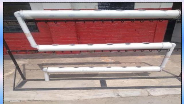
PVC PIPES WITH HOLES FOR WATER CIRCULATION

Materials used - PVC Pipe, TDS Meter, ph Meter, Stand, Water container, Fertilizer, Light-weight expanded aggregate