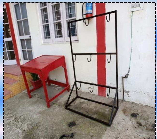
STRUCTURE FOR HOLDING